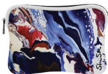
Neoprene Sleeve Front