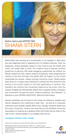
Artist Bio Card

Included inside the VIATRIS ADVOCATE Welcome Pack you'll find: