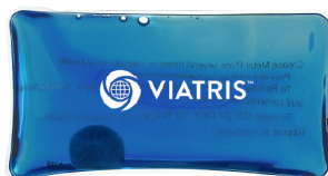
Hot Cold Gel Pack Front